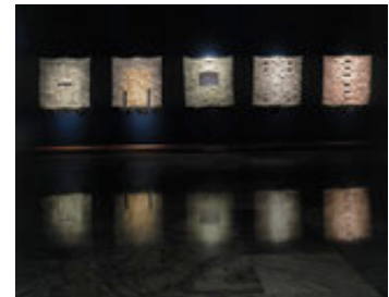
Milton Becerra "Mi moneda favorita" 1997 Linen fibers and Currency: $1, Bs. 5, 10, 20 & 50 8" x 47" e/a

Click on images for high resolution art.