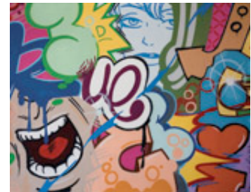
Spray Enamel on Canvas 81 3/4" x 104" 2011 "Screamer"